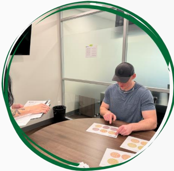
Health & Safety