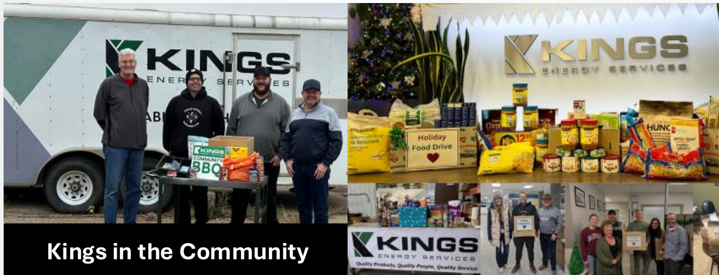
Kings in the Community

At Kings Energy Services we believe in actively engaging with the communities in which we operate, seeking to understand their needs and contribute to their development. We support local initiatives, participate in charitable programs, and encourage our employees to volunteer their time and expertise to make a positive social impact.